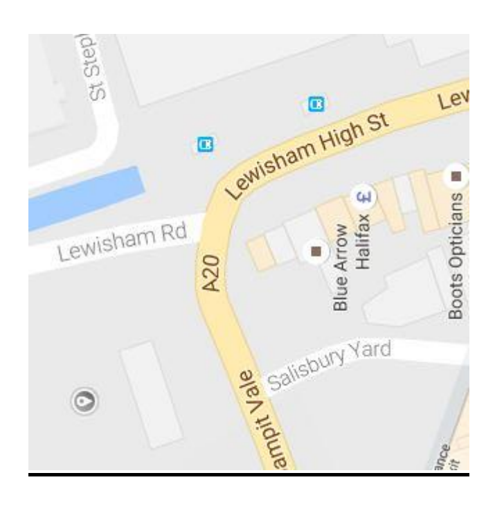
E.g. Lewisham Road/Lewisham High St/Loampit Vale junction