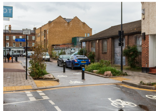
Berthon Street – Existing (left) . Example pocket park / Modal filter within Royal Borough of Greenwich (Right)

Doing this would reduce any left hook risks across the proposed cycleway and reduce through traffic on Creekside. Filtering Creekside would allow for a better public realm scheme outside the new Tidemill development on DCS and also the Bird's Nest Pub. A modal filter here would provide more green time for pedestrians and cycle traffic. Buses would also potentially benefit from faster journey times.