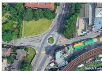
Reginald Road / Creekside Junction - Existing Layout

Doing this would reduce any left hook risks across the proposed cycleway and reduce through traffic on Creekside. Filtering Creekside would allow for a better public realm scheme outside the new Tidemill development on DCS and also the Bird's Nest Pub. A modal filter here would provide more green time for pedestrians and cycle traffic. Buses would also potentially benefit from faster journey times.