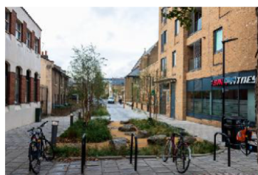
Example Pocket Park incorporating SUDS showing potential for creekside.